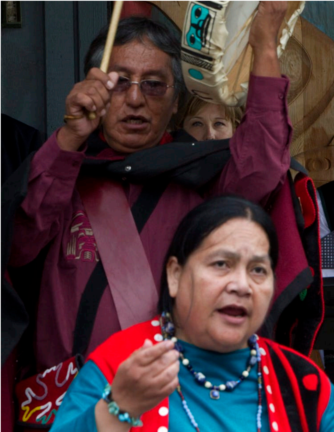
Former B.C. Premier Christy Clark is framed by dancers after she signed a historic agreement with Taku River Tlingit in July 2011 that created 13 newly protected areas in more than three million hectares of the Atlin Taku region in north-western B.C.